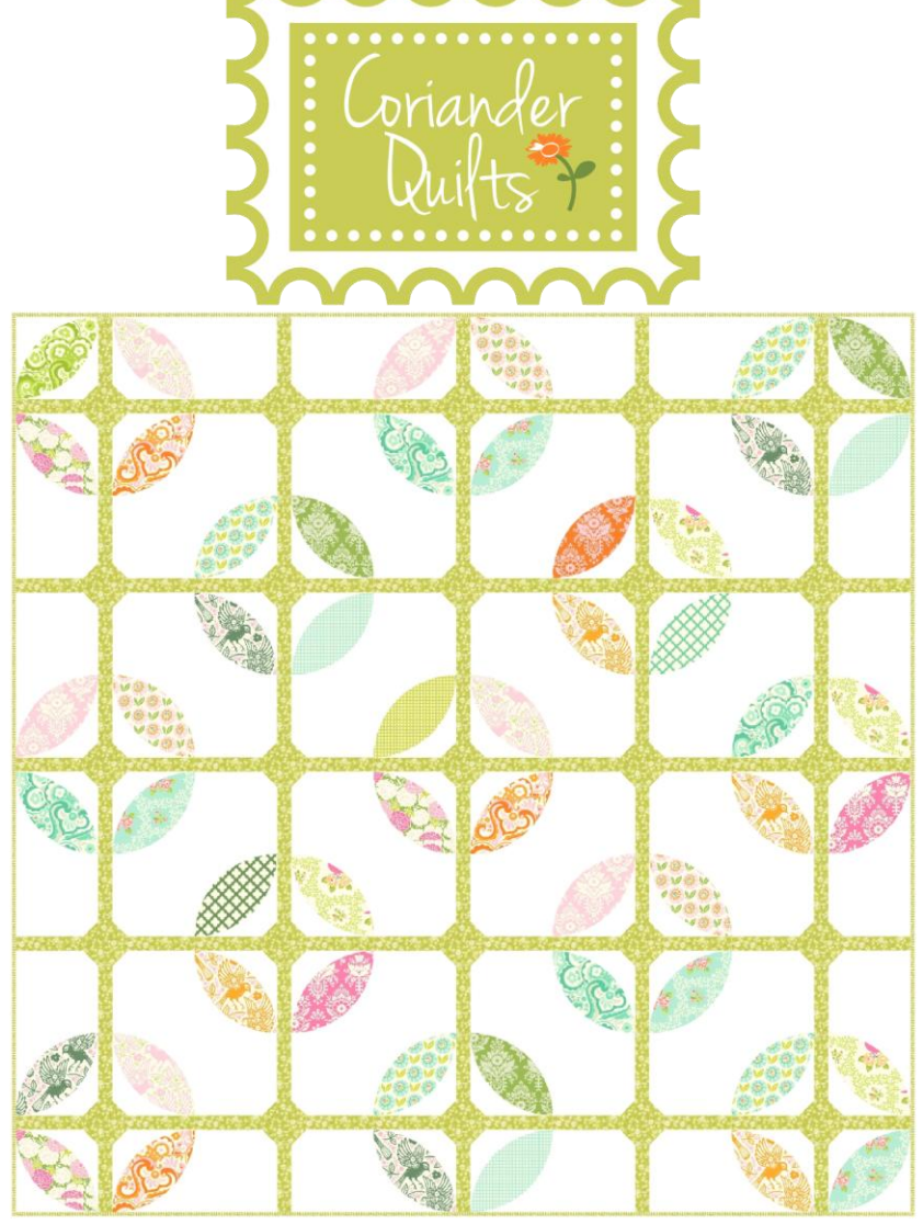
Finished Quilt Size: 60" x 60"

Website: www.littlemissshabby.com Email: corey@littlemissshabby.com @September 2014, Coriander Quilts